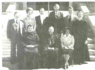
1977 ADVISORY BOARD