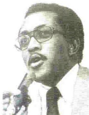
HON. EARL E. NELSON State Senator District #24

ON YOUR SILVER JUBILEE FROM YOUR STATE LEGISLATORS