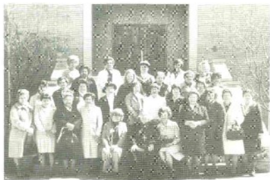
SISTERHOOD OF ST. HELEN