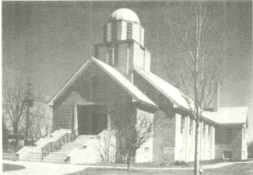
ST. ANDREW ORTHODOX CATHOLIC CHURCH