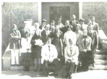
ST. ANDREW CHOIR