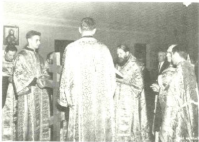
Metropolitan John (Wendland) blessing the cross for the cupola November 20, 1962